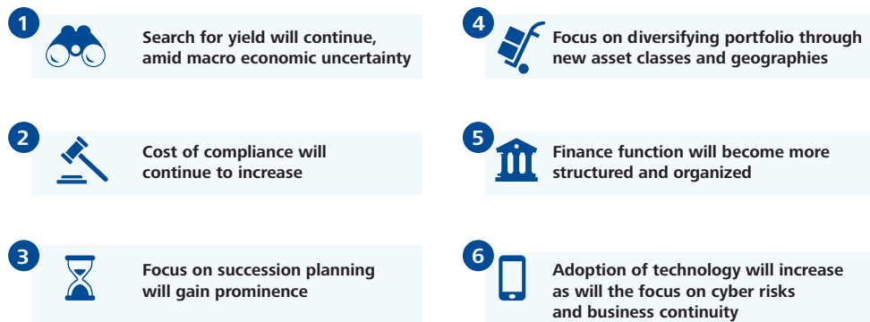
Figure 3: Six trends in the private wealth industry in 2014